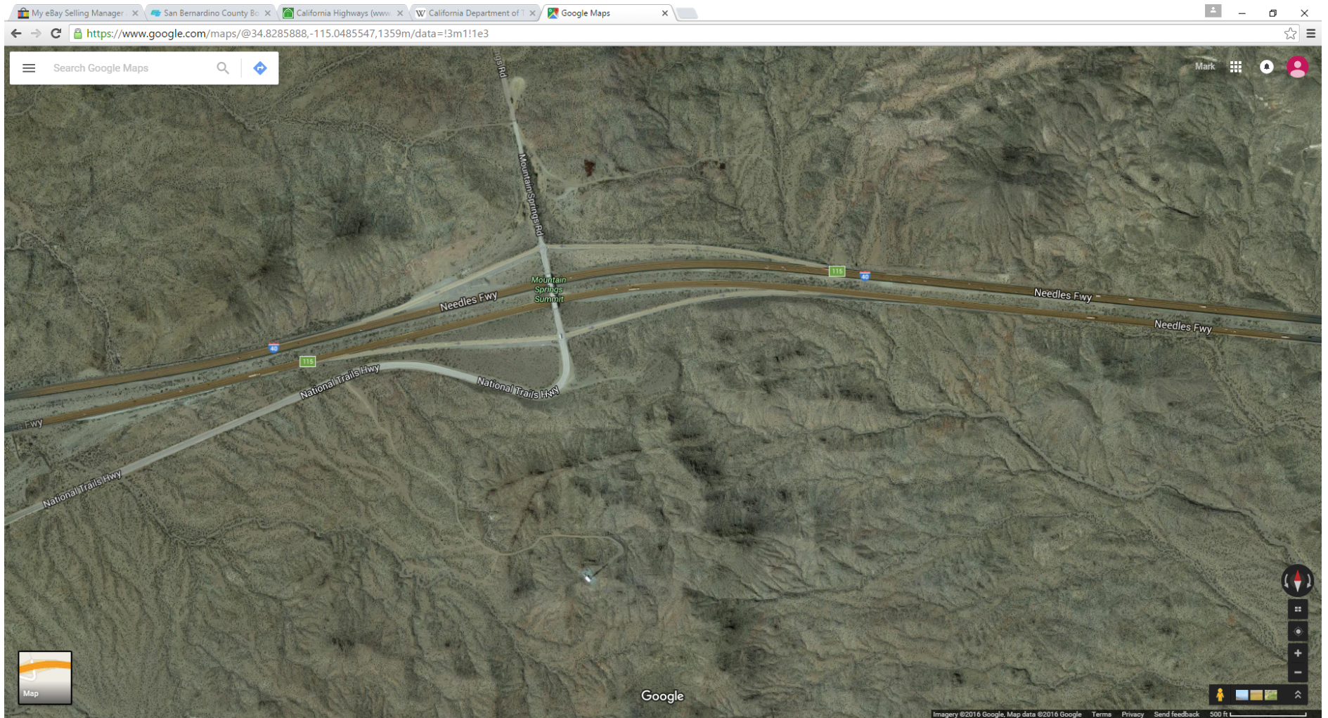
I-40 Postmile 115 Covers the Mountain Springs Oasis parcels